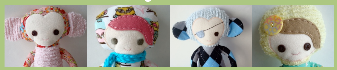
All rights reserved, subject to Terms of Use - Copyright 2014